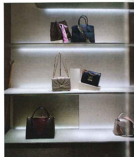
ELEMENTAL LED INC.