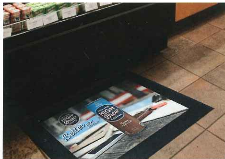
PROMOMATting FROM AMERICO