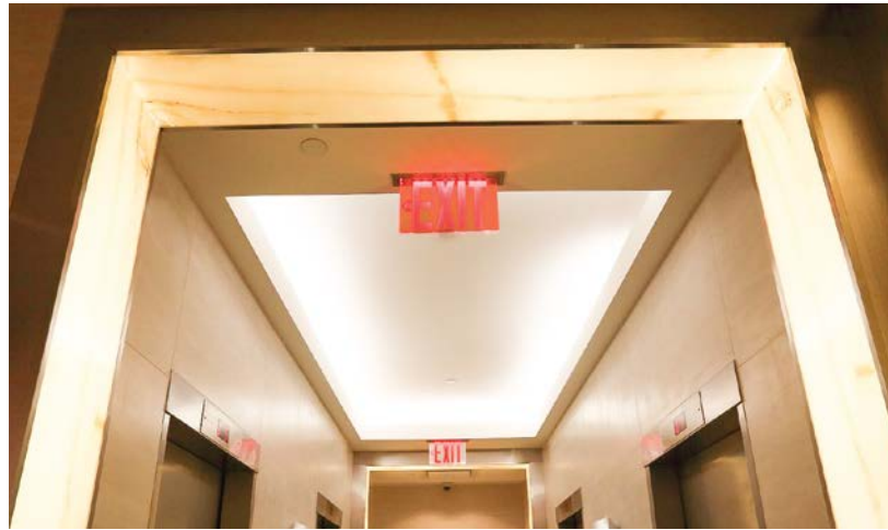
INDOOR ACCENT LIGHTING