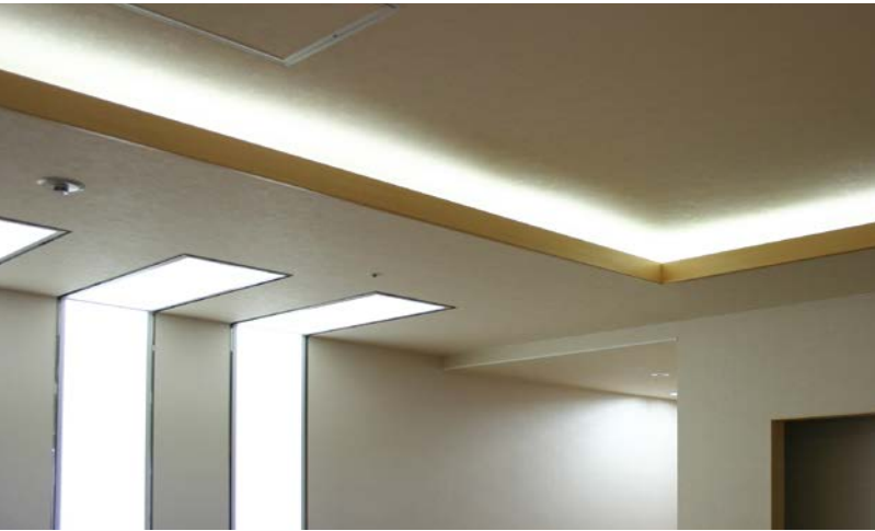
INTERIOR COVE LIGHTING